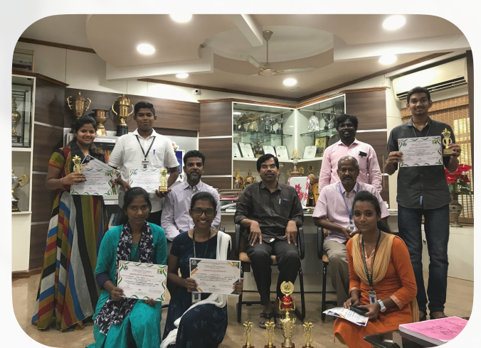
National Youth Parliament winners with Rev. Fr. Principal

This year the association sent a team of six trained students to take part in the "National Youth Parliament" competition, organised by Fatima College (Autonomous), Madurai on April 27, 2022. The team brought laurels for the college by winning the third place with cash prize ( \overline{\bullet}.10000/- ).