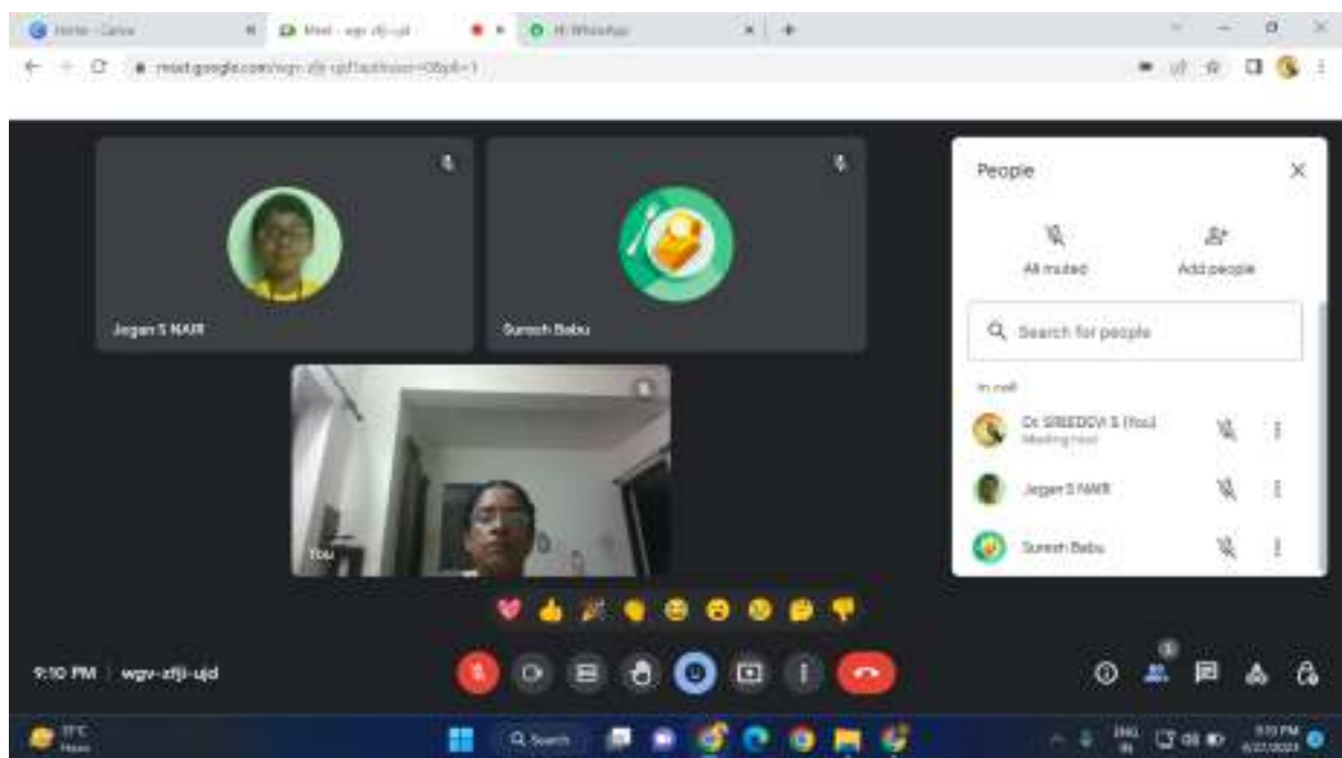
Online Class Session